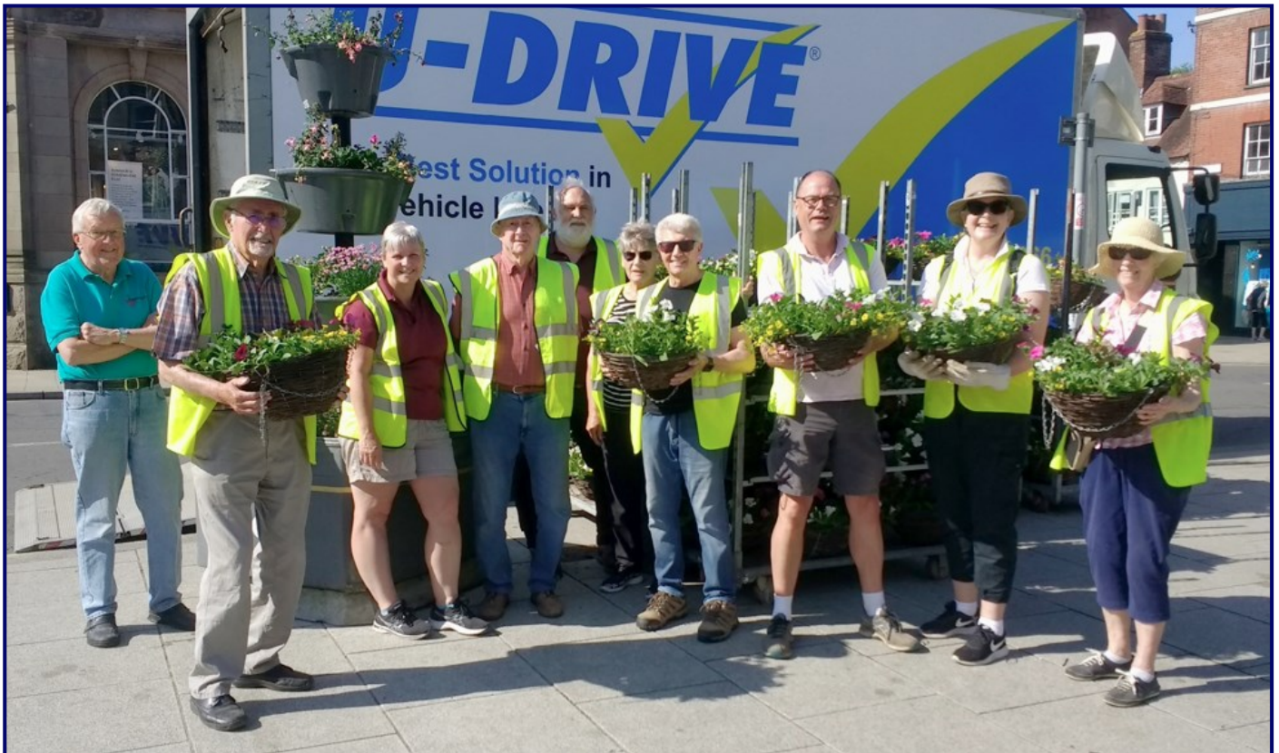
Wimborne in Bloom volunteers