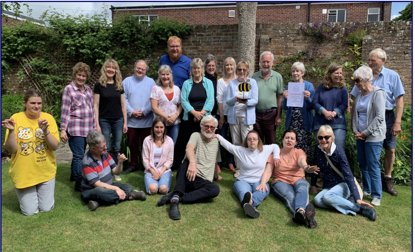
Members of local community group Wilding Wimborne receiving the Bee Friendly Town award from the Bee Friendly Trust. Wimborne Minster was one of six towns awarded the Bee Friendly status in 2022.

TC/02/03 Work in partnership with key stakeholders to develop and implement risk management and infrastructure plans, enhancing the town's and its residents' resilience to climate-induced extreme weather events.