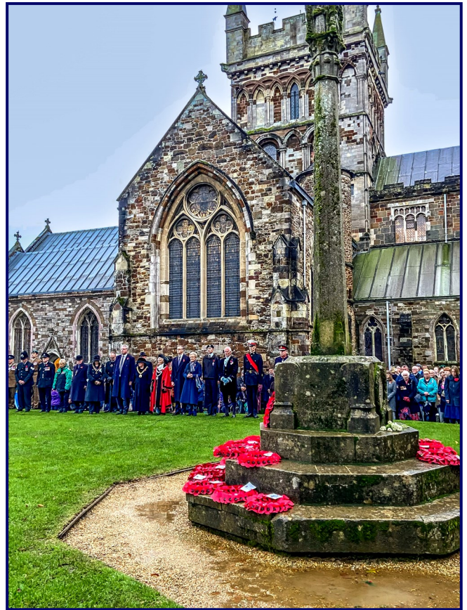
Remembrance Day at the Minster Green, 2023

TC/04/03 Support the work of local organisations that help our community and contribute to the delivery of local services via our Community Grant Scheme.